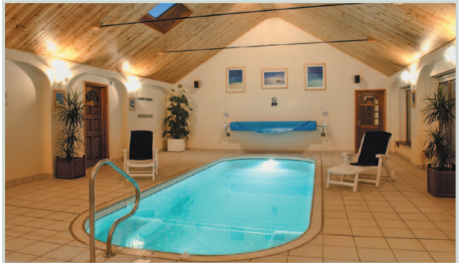
Combrew's luxury indoor swimming pool with high-powered jets is heated to a relaxing 37°

Our cottages and facilities are open all year round so why not join us at anytime of year for a relaxing well deserved break. Whatever the weather you are assured of an enjoyable holiday at Combrew and with tariffs from just £60 per guest per week something of a bargain too! Naturally our cottages are centrally heated, double glazed and have wood burners...a wonderful feature on a cold winters day!